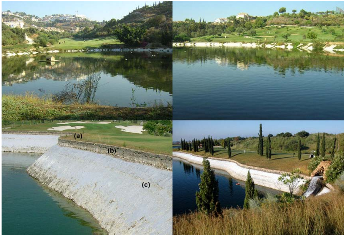
Figure 4. Types of artificial lakes inhabited by otters in golf courses. Details of the artificial lake shores: poor vegetative coverage (a), stone breakwater (b) and roofing felt (c).

The usual fauna in these lakes, which has the potential to serve as food sources for the otters, is made up of abundant specimens of Mediterranean turtle ( Mauremys leprosa ), the exotic Red-eared slider ( Trachemys scripta ), the Iberian water frog ( Pelophylax perezi ), and on the outside with frequent specimens of European common toad ( Bufo bufo ). The lakes are stocked on a regular basis with carps by the golf course maintenance team as they tend to disappear completely from the lakes (personal communication from green-keepers). The aims are to control the presence of mosquitoes and also for aesthetic aspects.