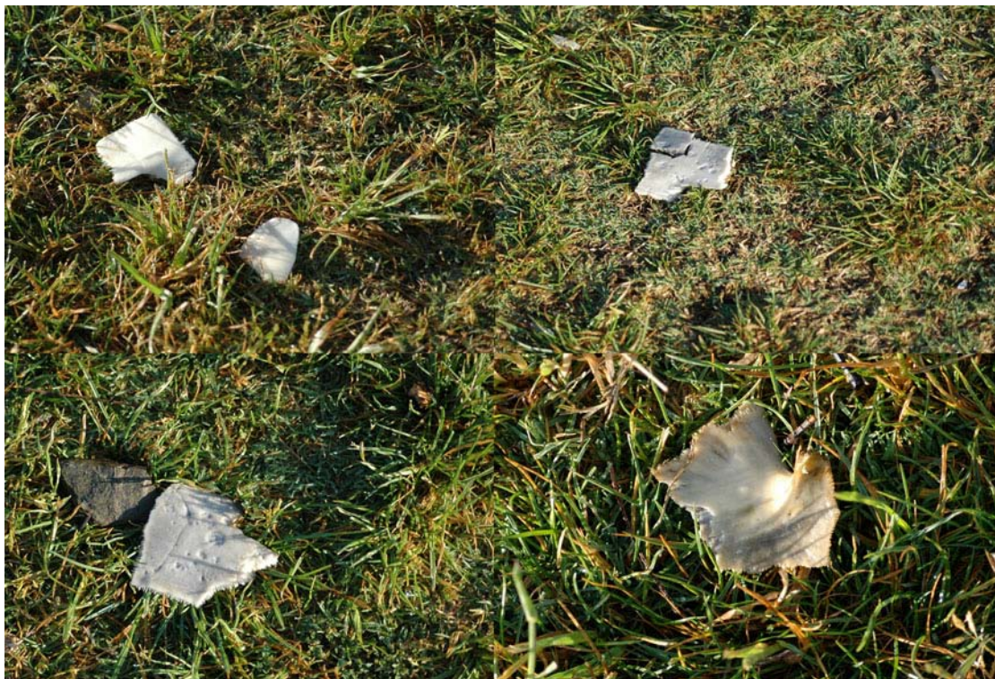
Figure 3. Carcass remains of a freshwater turtle in one of the artificial lakes of Los Flamingos Golf (Benahavís, Málaga).