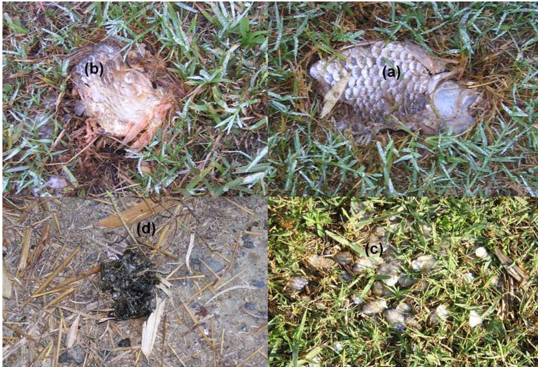
Figure 2. Carp ( Cyprinus carpio ) remains and otter's food remnants (a: operculum; b: pectoral fins; c: other bones and skin with scales). Otter excrement (d) in one of the artificial lakes of Los Arqueros Golf (Benahavís, Málaga).

water there is an area that is barren, varying in size depending on the depth of the water. The roofing felt overlaps and it has a steep incline (see Fig. 4 for typology and detail of these lakes).