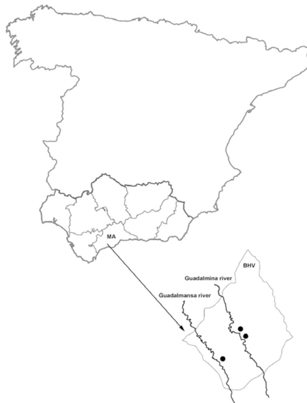
Figure 1. Location of the study area: Andalusia region (south of Spain), Málaga province (MA) and Benahavís municipality (BHV). In detail the the two rivers with otters and three points representing the location of the golf courses with positive signs for otter presence and feeding.

nearby roads (Duarte et al., 2008). In this note we demonstrate that they visit these areas to forage.